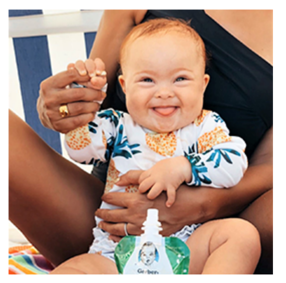
GLOBAL's July Webinar

Leading experts will share strategies on how to manage swallowing challenges in children with Down syndrome. Register Today!