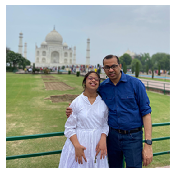
Share your Father's Day Photos

Leading experts will share strategies on how to manage swallowing challenges in children with Down syndrome. Register Today!